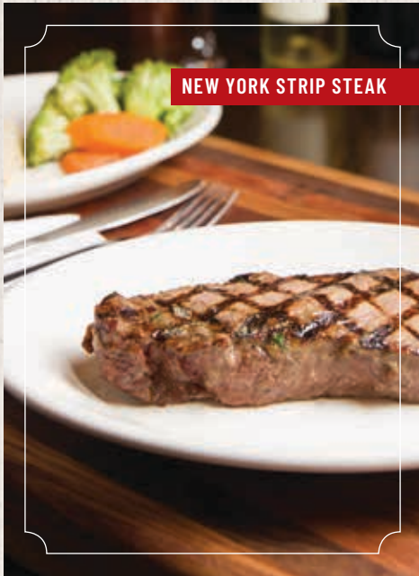
NEW YORK STRIP STEAK

Greek Fries - beer battered fries with crumbled feta cheese, lemon, oregano (2.49)