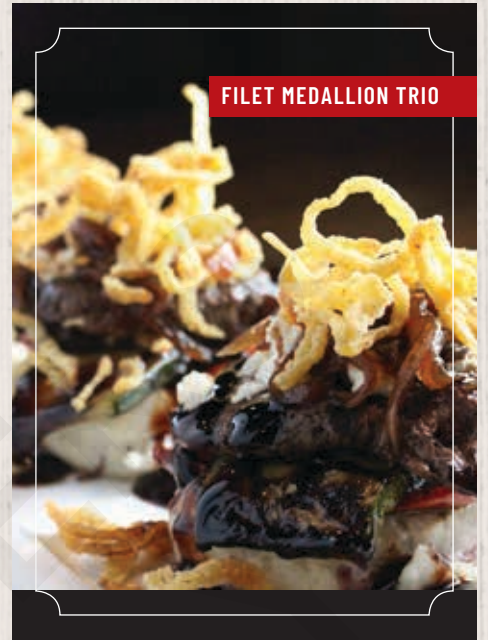
FILET MEDALLION TRIO

Broiled filet medallions crusted with garlic and herb boursin cheese, red wine demi-glace, over garlic mashed potatoes, caramelized onions, grilled red peppers and zucchini, topped with crispy onions / 29.99