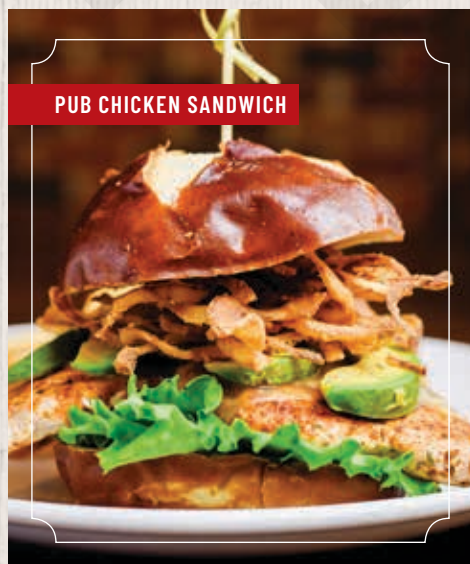
PUB CHICKEN SANDWICH

Delicious gyro meat, shredded lettuce, onion, tomato, crumbled feta cheese, and tzatziki sauce, in a whole wheat tortilla / 14.99