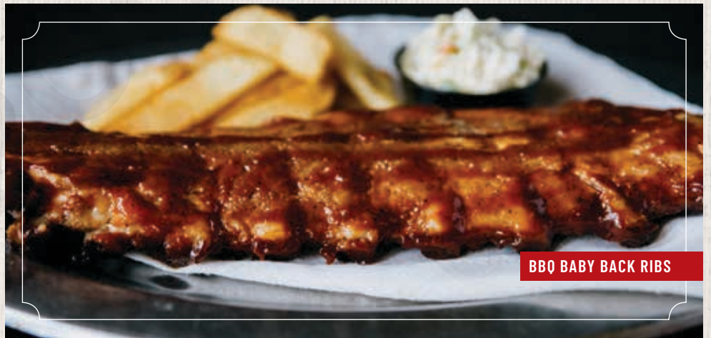
BBQ BABY BACK RIBS

RIBS AND GOLDEN CHICKEN FINGERS Half slab of tender ribs with hand cut, beer battered, deep fried chicken strips / 25.99