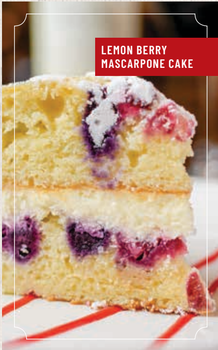
LEMON BERRY MASCARPONE CAKE